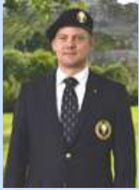
Official Uniform of the Fourth Degree

Fourth Degree Exemplification, St. Maximilian Kolbe, October 15, 2020